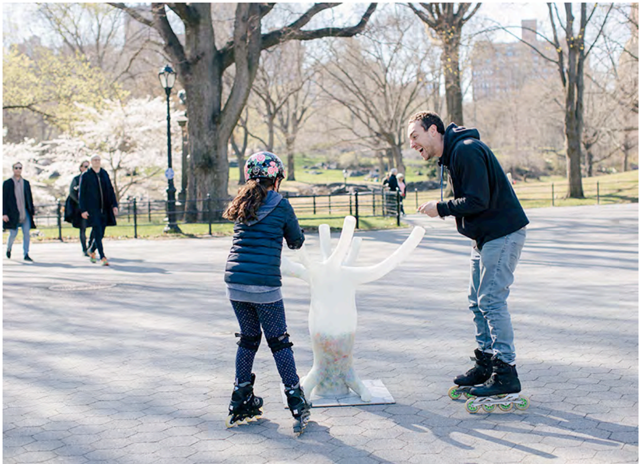
Our Memories at Naumburg Bandshell in Central Park on April 20 th , 2018

For over 50 years, NYC Parks' Art in the Parks program has brought contemporary public artworks to the city's parks, making New York City one of the world's largest open-air galleries. The agency has consistently fostered the creation and installation of temporary public art in parks throughout the five boroughs. Since 1967, NYC Parks has collaborated with arts organizations and artists to produce over 2,000 public artworks by 1,300 notable and emerging artists in over 200 parks. For more information about the program visit www.nyc.gov/parks/art .