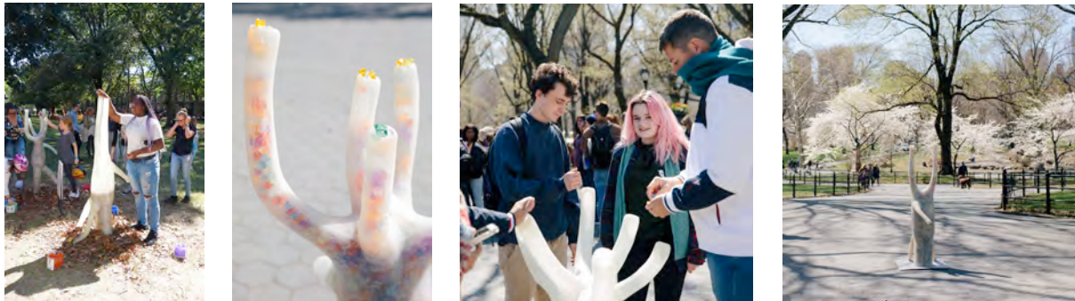
Our Memories installations on Governors Island (first photo, 2016) and in Central Park (April 20 th 2018)

A participatory public artwork which weaves people's lives and experiences into a collective memory.